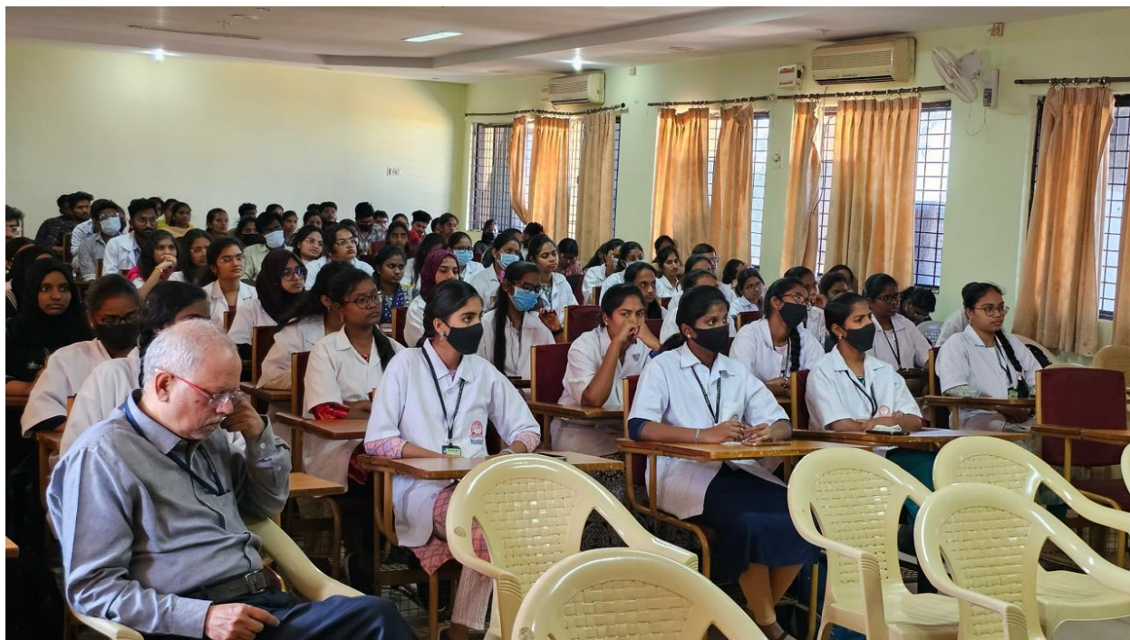
STUDENTS LISTENING TO THE GIVEN INSTRUCTIONS

(Affiliated to JNTUH, Approved by AICTE and PCI, New Delhi. Accredited by NAAC)